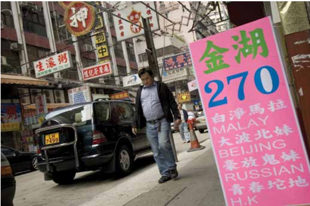
This sign, outside a Hong Kong club, reads: "Young, fresh Hong Kong girls; White, clean Malaysian girls; Beijing women; Luxurious ghost girls from Russia." According to U.S. Government statistics, the majority of victims of human trafficking moved across international borders - about 65% - are trafficked for the purpose of sexual exploitation.

The Philippines is a source as well as destination country for human trafficking. It also serves as a transit country. Estimates of Filipino and foreign child victims run as high as 100,000.